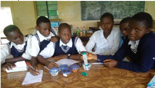
Project AFARA™ Students in Ado-Ekiti, Nigeria working on seed germination (2010).

We are extremely pleased to inform you of the start ISTG's international science and technology program, project AFARA™: the Fall 2011 edition, which will include approximately 120 middle and high school students ranging from grades 8-12 (or ages 12-18) from North Grand High School (Chicago, USA) and Christ's School Senior (Ado-Ekiti, Nigeria) . The duration of this round of Project AFARA™ will be 4 weeks (November 14, 2011- December 12, 2011).